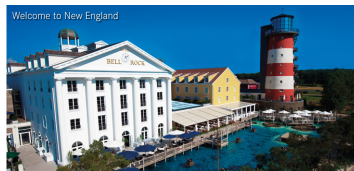
Welcome to New England