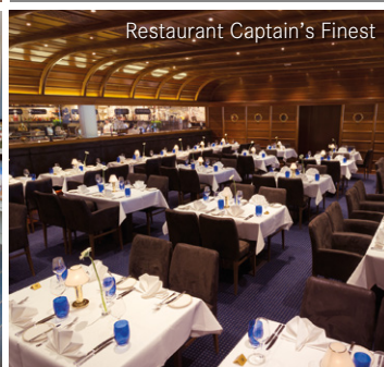
Restaurant Captain's Finest