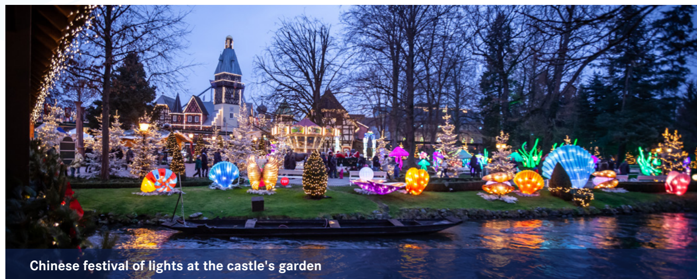
Chinese festival of lights at the castle's garden