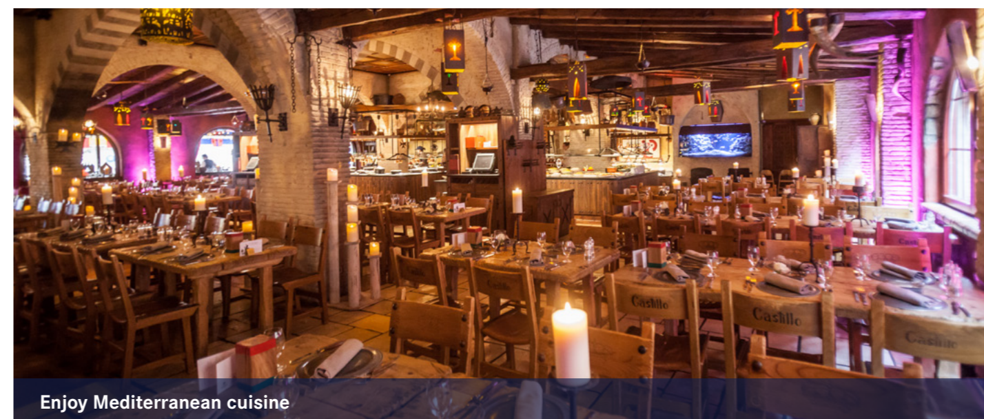
Enjoy Mediterranean cuisine